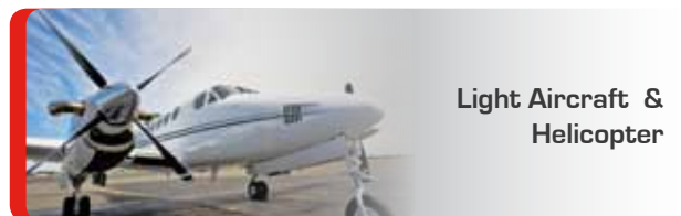
Light Aircraft & Helicopter